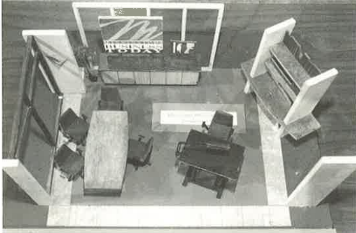
Miniature of "Mississippi Business Today" set

With an eye toward identifying and recognizing individuals and companies promoting business and industrial growth in the state, the Mississippi Authority for Education Television (ETV) and The University of Mississippi are teaming up to produce the weekly show "Mississippi Business Today."