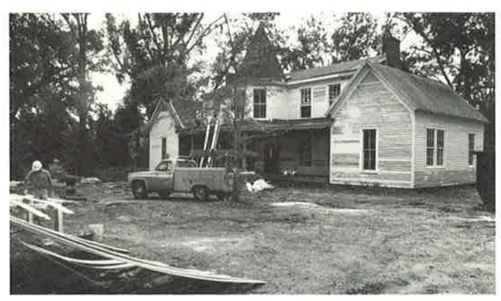
Memory House renovation underway, Summer 1994

Extensive renovation will preserve the Victorian charm of "Memory House," while providing new and functional work areas for the Office of University Development and Foundation staff members. A drive to raise funds to complete the much-needed renovation is currently underway and to date members of the Foundation Board of Directors have person-